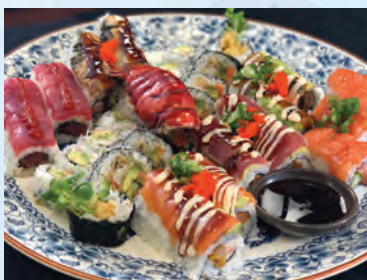
PLATTER B (ALL ROLLS)