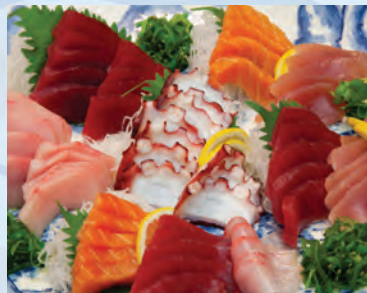
PLATTER E (CHEF'S SELECTION)