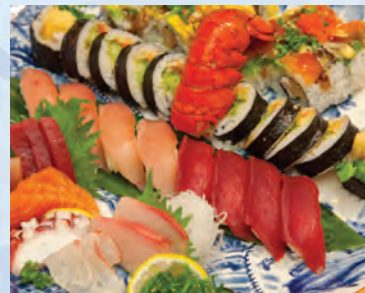
PLATTER F (ROLLS, NIGIRI & SASHIMI)