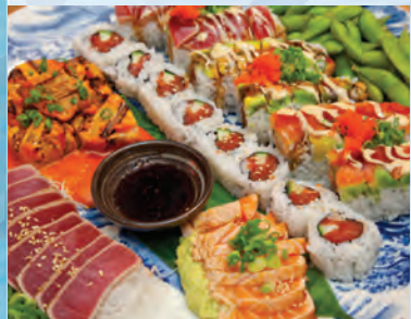
PLATTER D (ROLLS & SPECIAL DISHES)