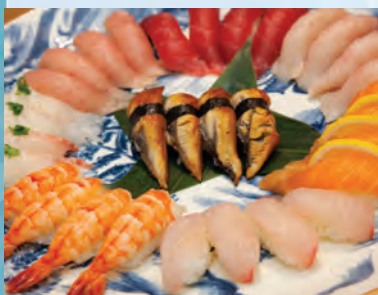
PLATTER A (ALL NIGIRI)