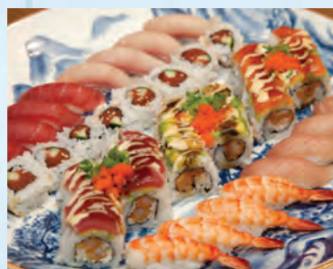
PLATTER C (ROLLS & NIGIRI)