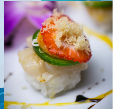
MANGO TANGO SCALLOP