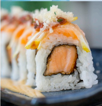
DOUBLE DECKER ROLL