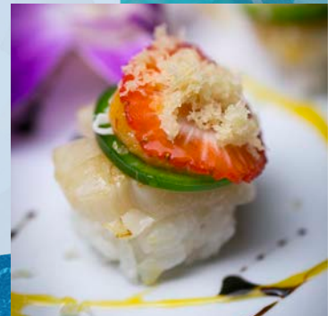
MANGO TANGO SCALLOP