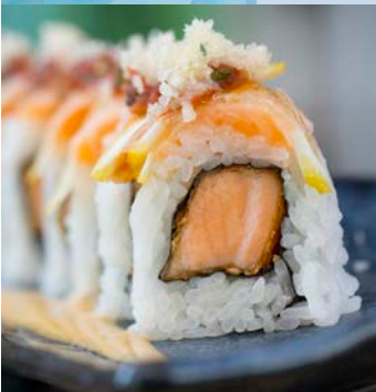
DOUBLE DECKER ROLL